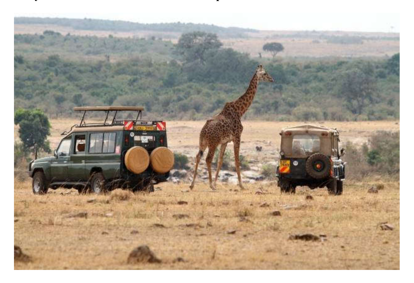
Game Viewing Deck