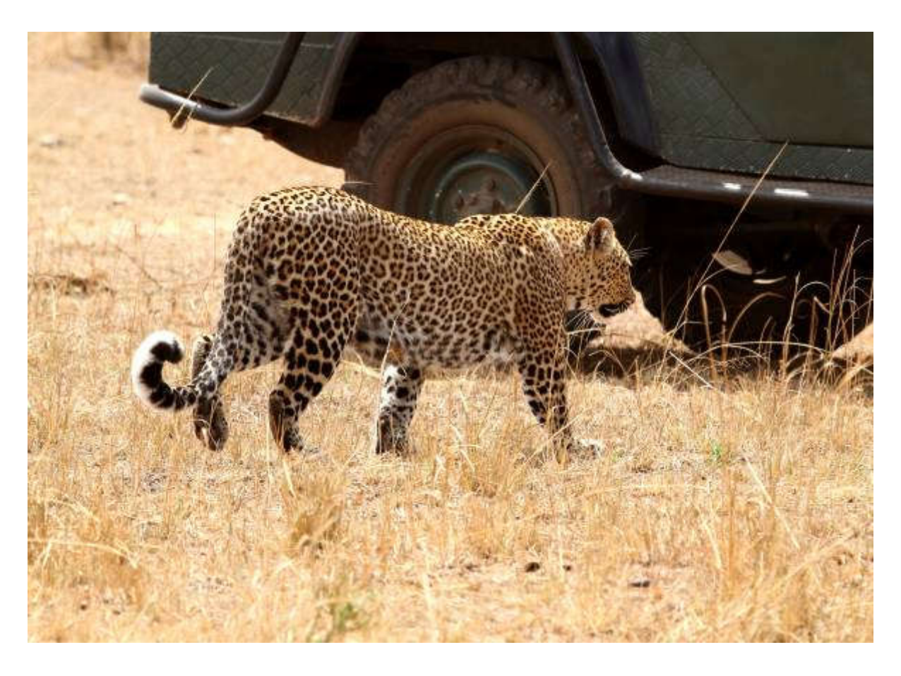
We Kids Had Tons of Fun Exploring the African Wildlife Now Its your Turn