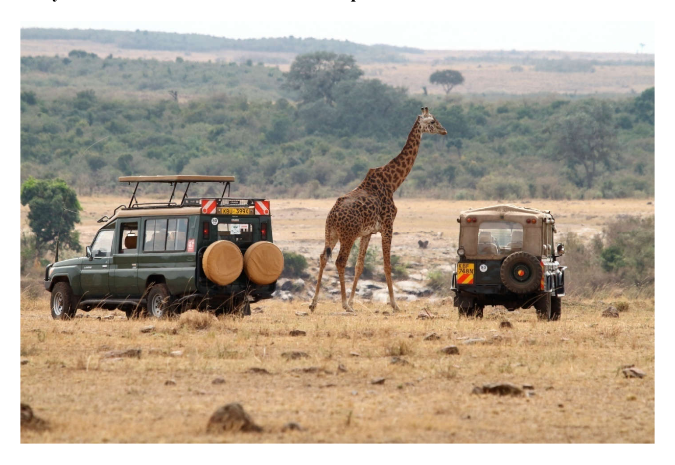
Game Viewing Deck