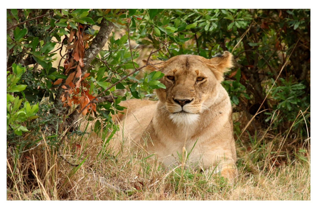
Day 3, 4, 5 – Sep 26<sup>th</sup>, Sep 27<sup>th</sup> Sep 28<sup>th</sup> - Game drives through the day looking for different mammals and bird species in Mara / Keekorok zone. (Breakfast, Lunch & Dinner). On one of the days visit the Masai Village and interact with the Masai tribes. Also shop for some products made by the tribes.