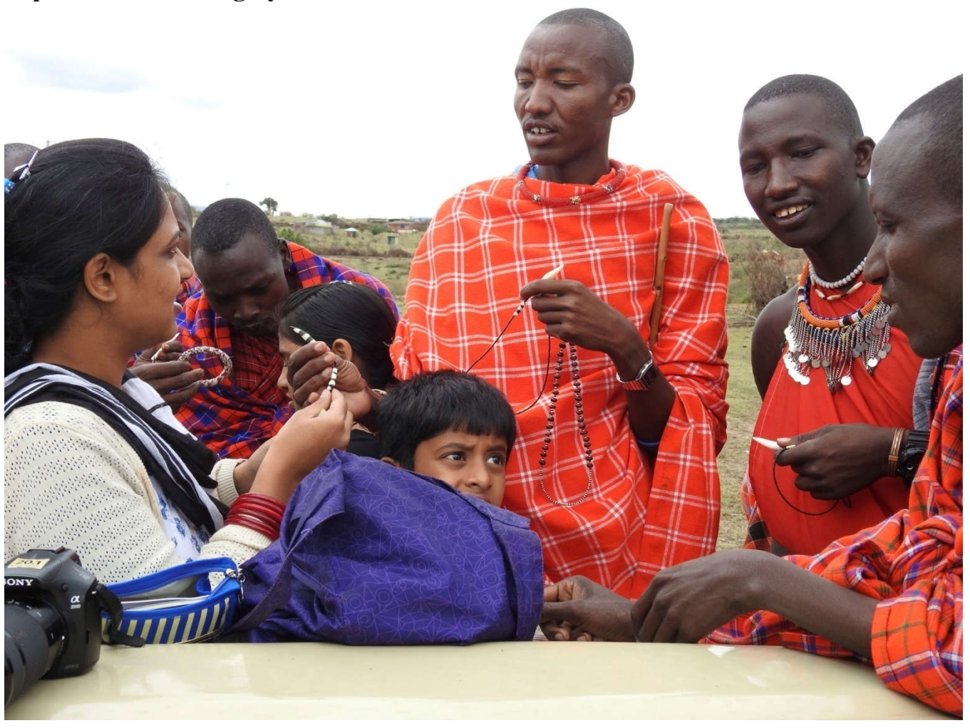
Day 6 – Sep 29<sup>th</sup>: Masai Mara - Nairobi

Experience Bartering System with the Masai Tribes