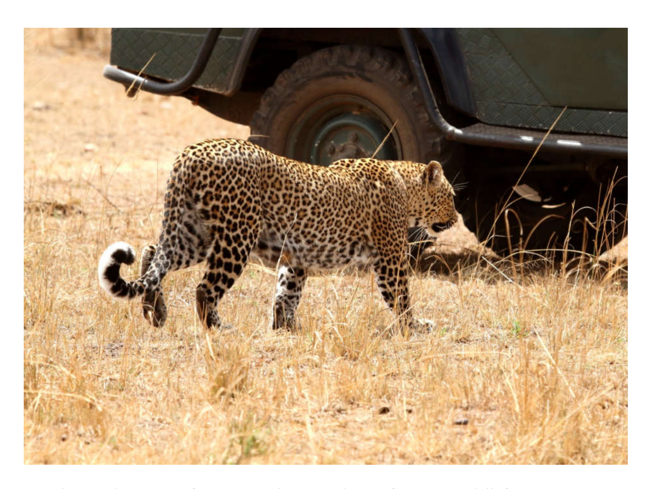
We Kids Had Tons of Fun Exploring the African Wildlife Now Its your Turn